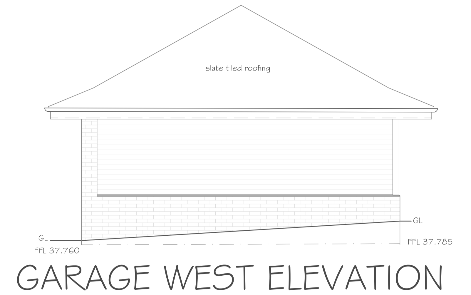
GARAGE WEST ELEVATION